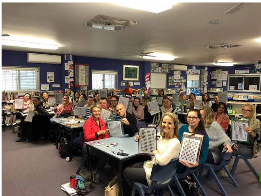
STAFF DEVELOPMENT DAY