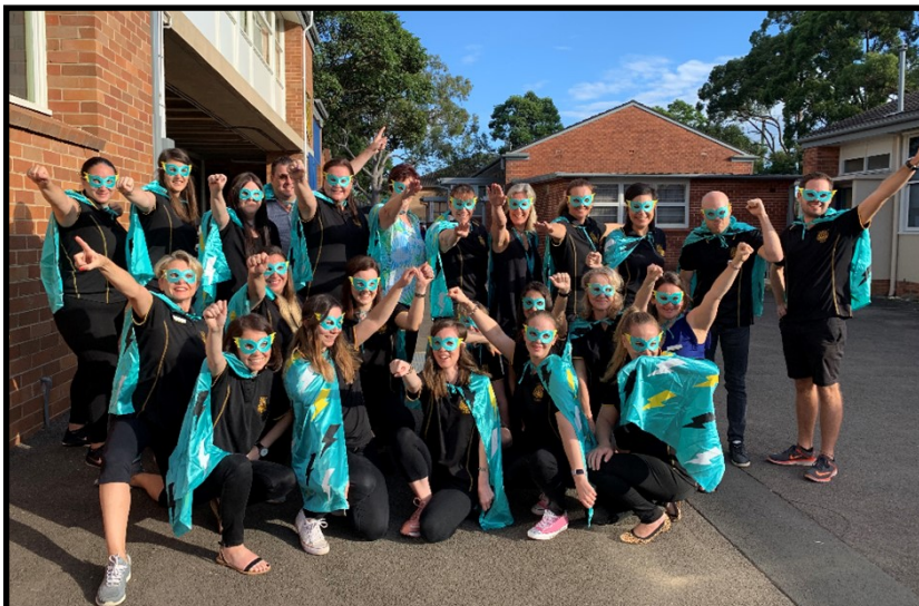
OUR SUPERHERO STAFF