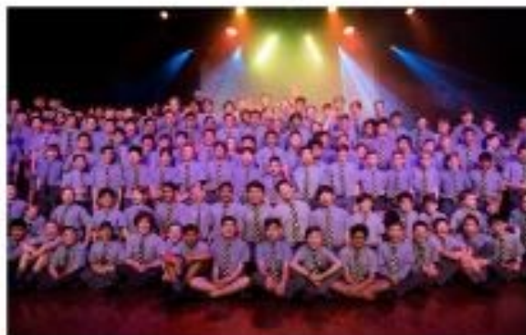
Year 7, Massed Choir

Information Afternoon Thursday 21 February 2019 4 – 6 pm