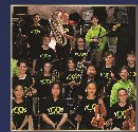
Youth Choir and Orchestra Sydney