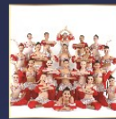
Macquarie Performing Arts