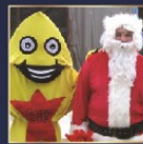
Singing Stars & Santa Claus