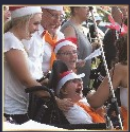
Royal Rehab Lifestyle Community Choir