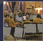
Backing by Leichhardt Celebrity Brass